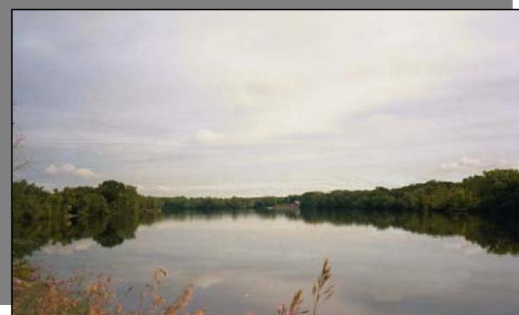
Moreau State Park is one of the Town's many natural features

In early 2000, the Town of Moreau appointed a group of ten volunteers as the Comprehensive Planning Committee to create a Comprehensive Land Use Plan. With the support of the Town Board, and under the guidance of a consultant, the Committee has worked to articulate a community vision and provide direction for future land use development. The objective of this effort is to study the built and undeveloped environment and determine the status of existing conditions in the community. The Committee then worked to develop a Comprehensive Plan to accommodate new commercial, industrial, and residential development while assuring the protection of the natural resources in the community, as well as preservation of the essential character of Moreau as a vital Hudson River community. The Committee has held 15-20 meetings and has entertained presentations by the Saratoga Economic Development Corporation (SEDC), the Adirondack-Glens Falls Transportation Council, (AGFTC), and the Saratoga County Planning Department. In addition, students from the South Glens Falls School District were interviewed for their perspective on community issues.