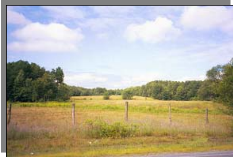
Open spaces are an important attribute in Moreau

The community survey reported that residents think favorably of the Town, experience what they consider to be a high quality of life, and have a positive outlook for Moreau's future. Residents' concerns centered on the continued path of moderate growth in the residential sector without