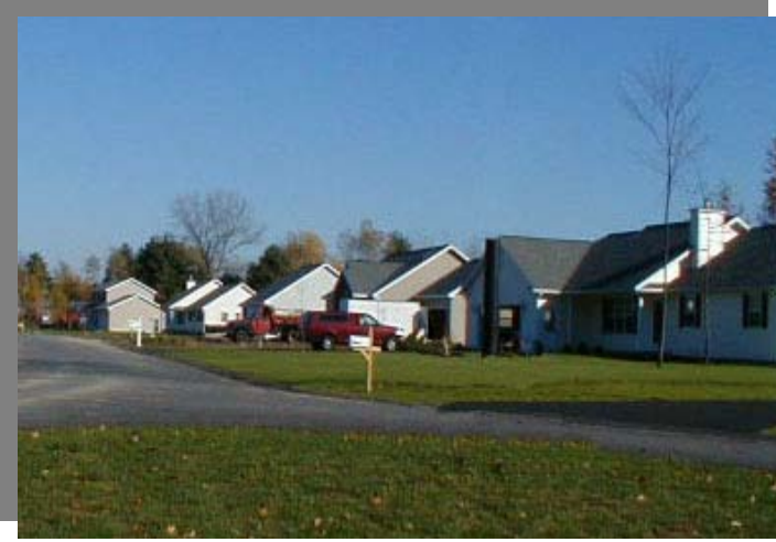
Moreau has a growing housing market

In general, the inventory of affordable, suitable housing in the Town has diminished when compared to previous years in the 1980's and 1990's. This is particularly the case with housing choices for retired, elderly persons looking to relocate within the Town or looking to reside in the Town for the first time.