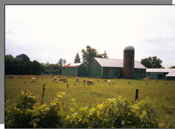
Farms contribute to the rural, open qualities of the Town landscape

Moreau has a variety of land uses that contribute to its unique community land use pattern. The mix of agricultural uses, horse farms, golf course, and open fields enhance the aesthetics and benefits of country living. Proximity to the Northway provides residents with additional amenities including efficient access to jobs, shopping, and recreational opportunities.