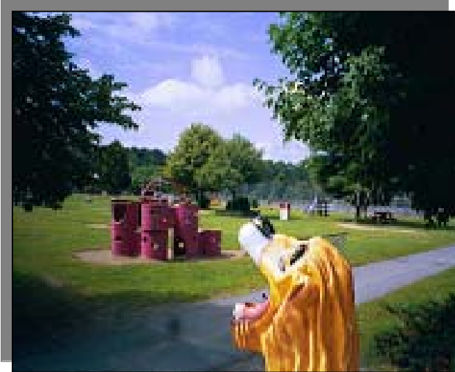
The Harry J. Betar Jr. Recreational Park is the Town's premier park