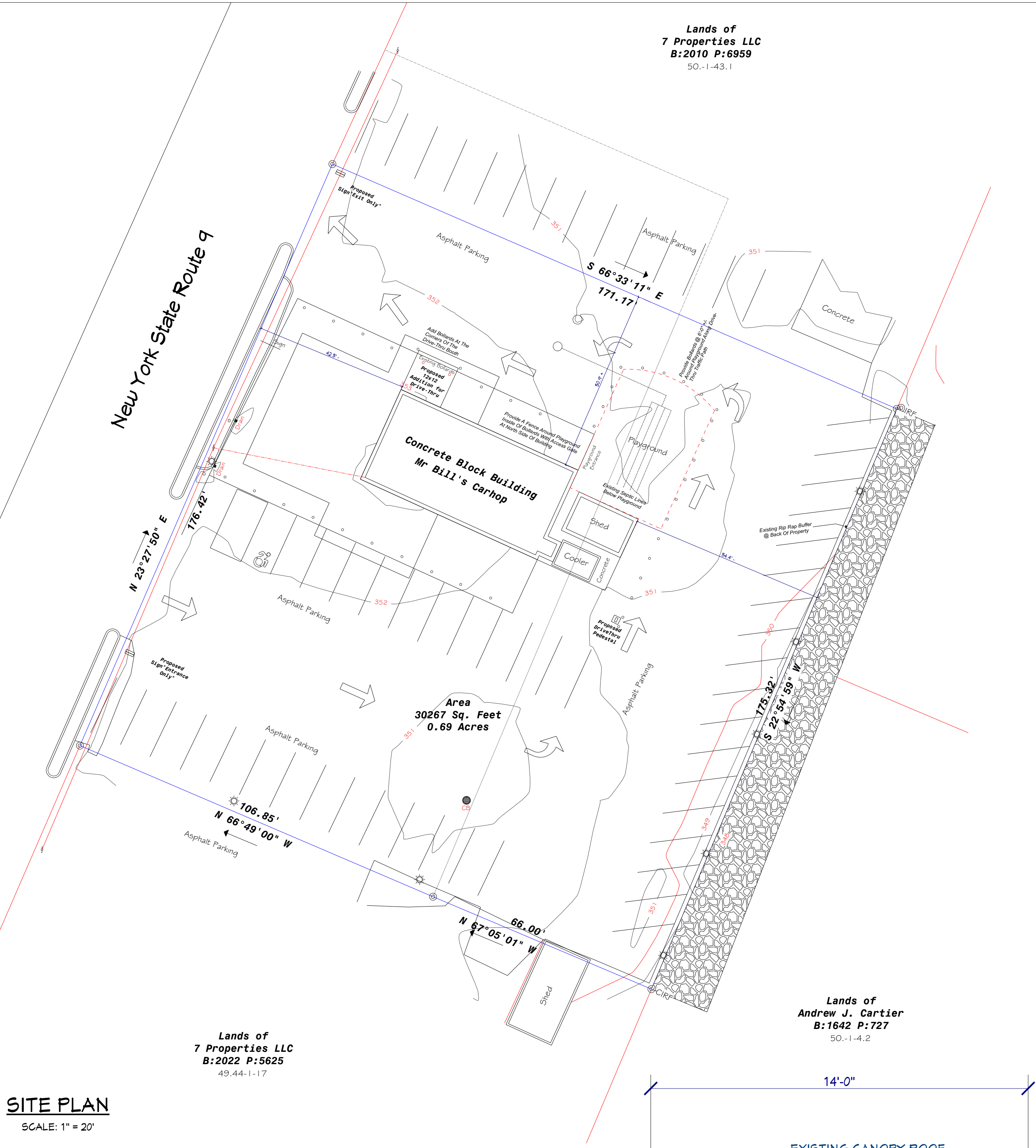
SITE PLAN SCALE: 1" = 20'